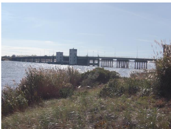
Existing Bridge, view to the southwest