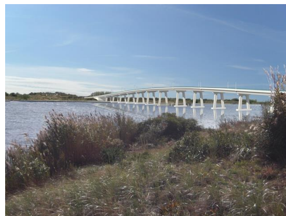
Proposed Bridge Rendering, view to the southwest

Suffolk County ensures that no person is excluded from participation, denied the benefits of, or discriminated against under its projects, programs or activities on the basis of race, color, creed, national origin, sex or age. If you require special accommodations such as due to a hearing or visual impairment, or a translator for interpretation, to provide assistance in attending this meeting, please contact (646) 388-9742 by June 9, 2016 to facilitate your participation.